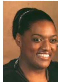
Jessye Norman, soprano, 1966 NSAL Washington, DC Chapter winner

Stars and came backstage after the performance to wish us congratulations and allow us a chance to talk to her. Before she arrived, I was looking her up on the internet and I saw that she won the NSAL Competition at the exact same time in her career that I did - her junior year of undergrad! I took that as a sign to write to you with great gratitude for everything you have done for me this far and express to you how much I can't wait to be reunited at some point whether artistically or otherwise!