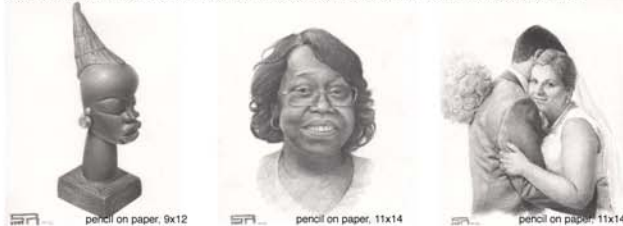
pencil on paper, 9x12

This month I also have work featured in the "small works show" at Glave Kocen Gallery, 1620 West Main St. Richmond VA, 23220. This is my second year participating and I'm very excited. I've attached one my newest drawings for my next exhibit in 2014! This drawing is of an african sculpture. It will be on display at Glave Kocen until the end of January. I've also attached two sketches I drew for two other families.