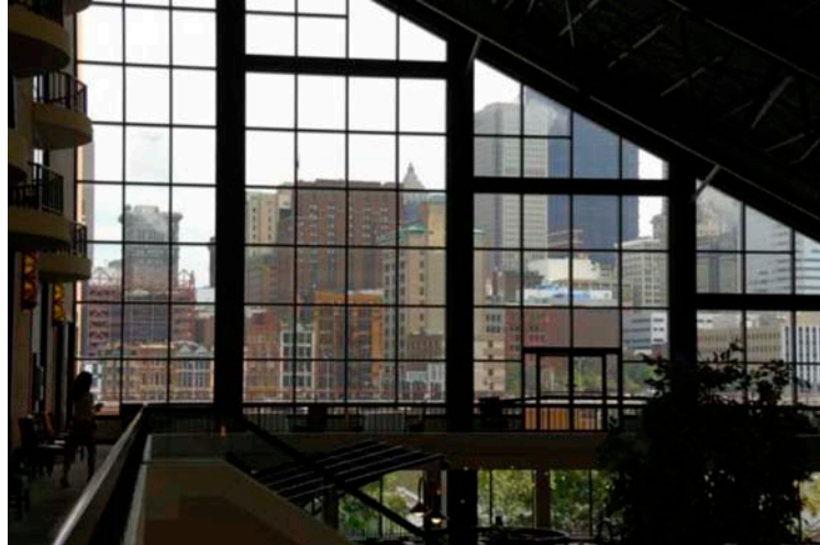
Pittsburgh skyline view from Sheraton Station Square Hotel lobby.

We will be staying at the Sheraton Station Square Hotel with riverfront views. NSAL has arranged a special rate for you. Call the hotel at (412) 261-2000 to enquire. http://www.sheratonstationsquare.com