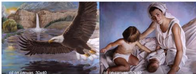
oil on canvas, 30x40

Below I have two big paintings I finished for clients. They each were really fun to work on. One in particular was done for the Bishop at my church, and it was such an honor to paint it. I usually don't work in landscapes, so that one definitely stretched my spirit and my abilities for the better. The other piece was a painting I did of picture over 30 years old. They gave it to me, and told me they wanted to capture an intimate moment in time. I really enjoyed the composition in both pieces. God is good.