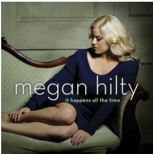
Megan Hilty's debut solo album